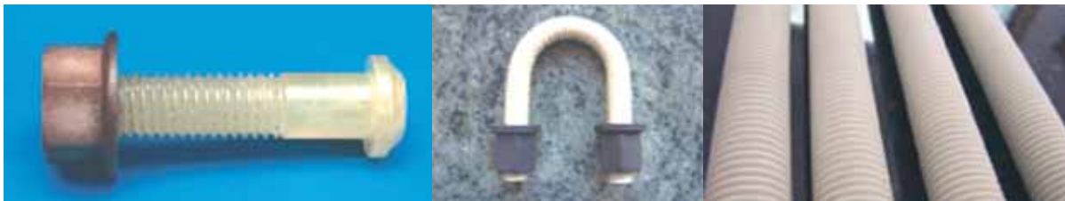
Large diameters&alternative thread forms